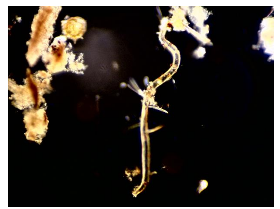
Nematode in darkfield.

NOTE: If purchased with the microscope, your EXM-150 microscope should arrive with the darkfield annulus (stop) already installed.