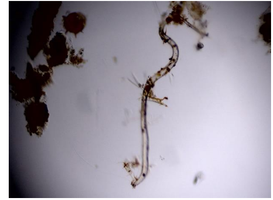
Nematode in brightfield.