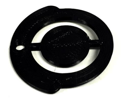
Darkfield annulus (CAT# 150-3220)

IMPORTANT: The darkfield annulus is effective with 4x and 10x objectives on the EXM-150 models specified above. It is not recommended for use with 40x or 100x objectives.