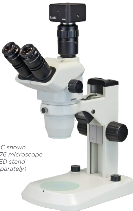
MPX-20C shown on a 3076 microscope on an LED stand (sold separately)