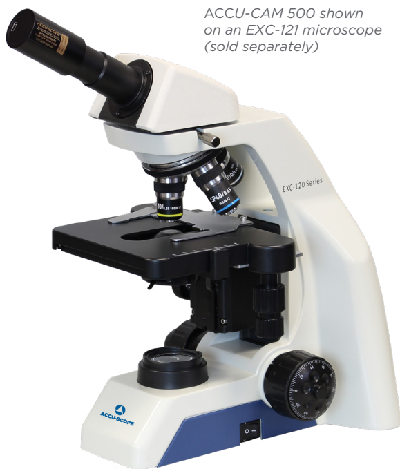
ACCU-CAM 500 shown on an EXC-121 microscope (sold separately)