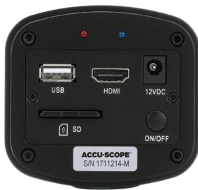
Model AU-600-HDS shown on EXC-400 microscope