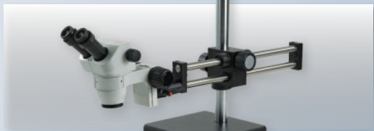
On a Ball Bearing Boom Stand

Versatile • Multi-functional • Affordable IDEAL FOR OEM, INDUSTRIAL & LIFE SCIENCE APPLICATIONS