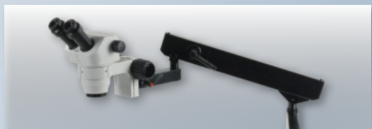
On a Flex Arm Stand